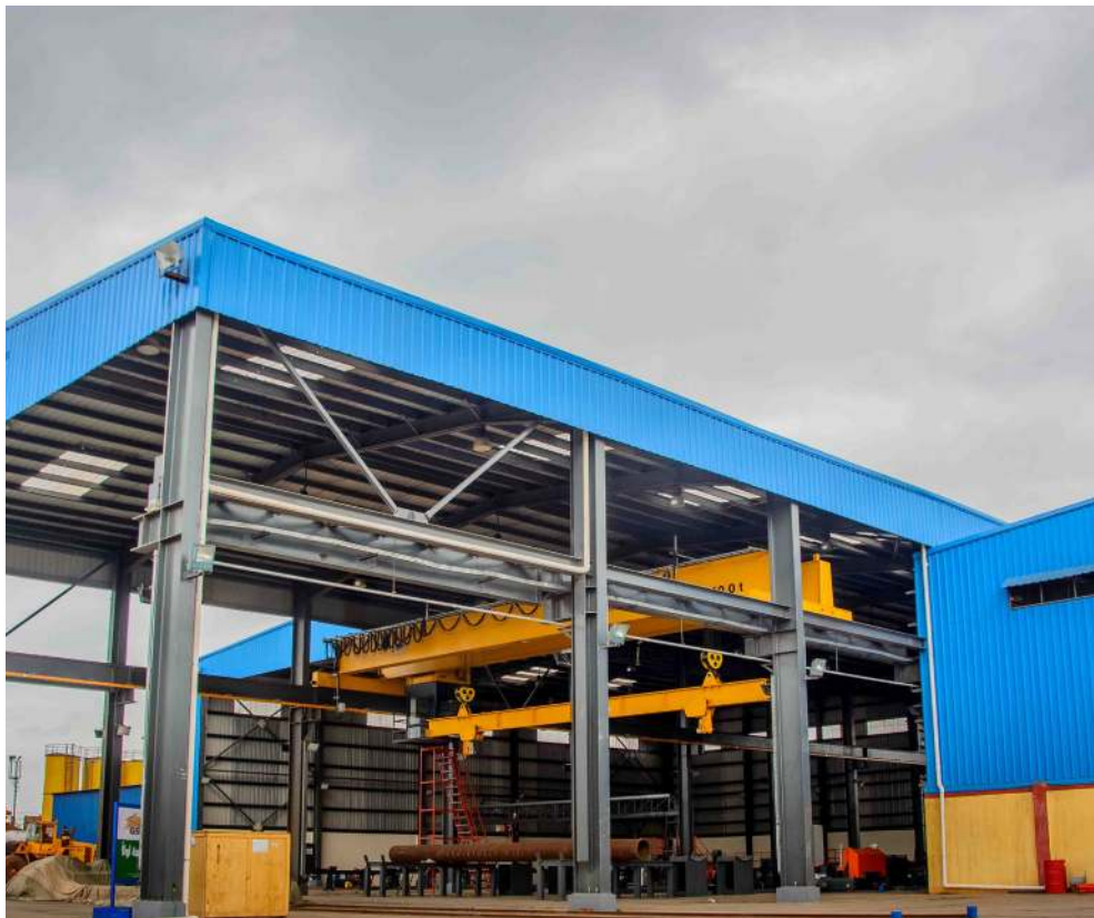
Client Name: Petrojet Project Name: Pipes concrete coating factory GSF Scope: Installation of structural steel and mechanical equipment