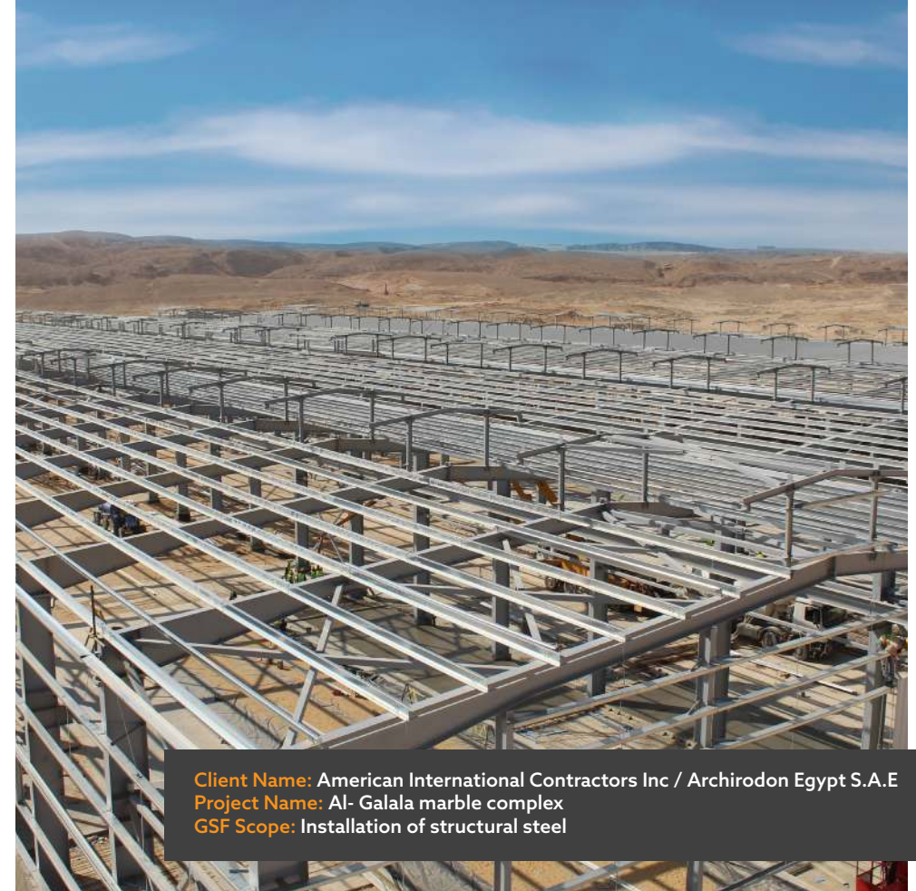
Client Name: American International Contractors Inc / Archirodon Egypt S.A.E Project Name: Al- Galala marble complex GSF Scope: Installation of structural steel