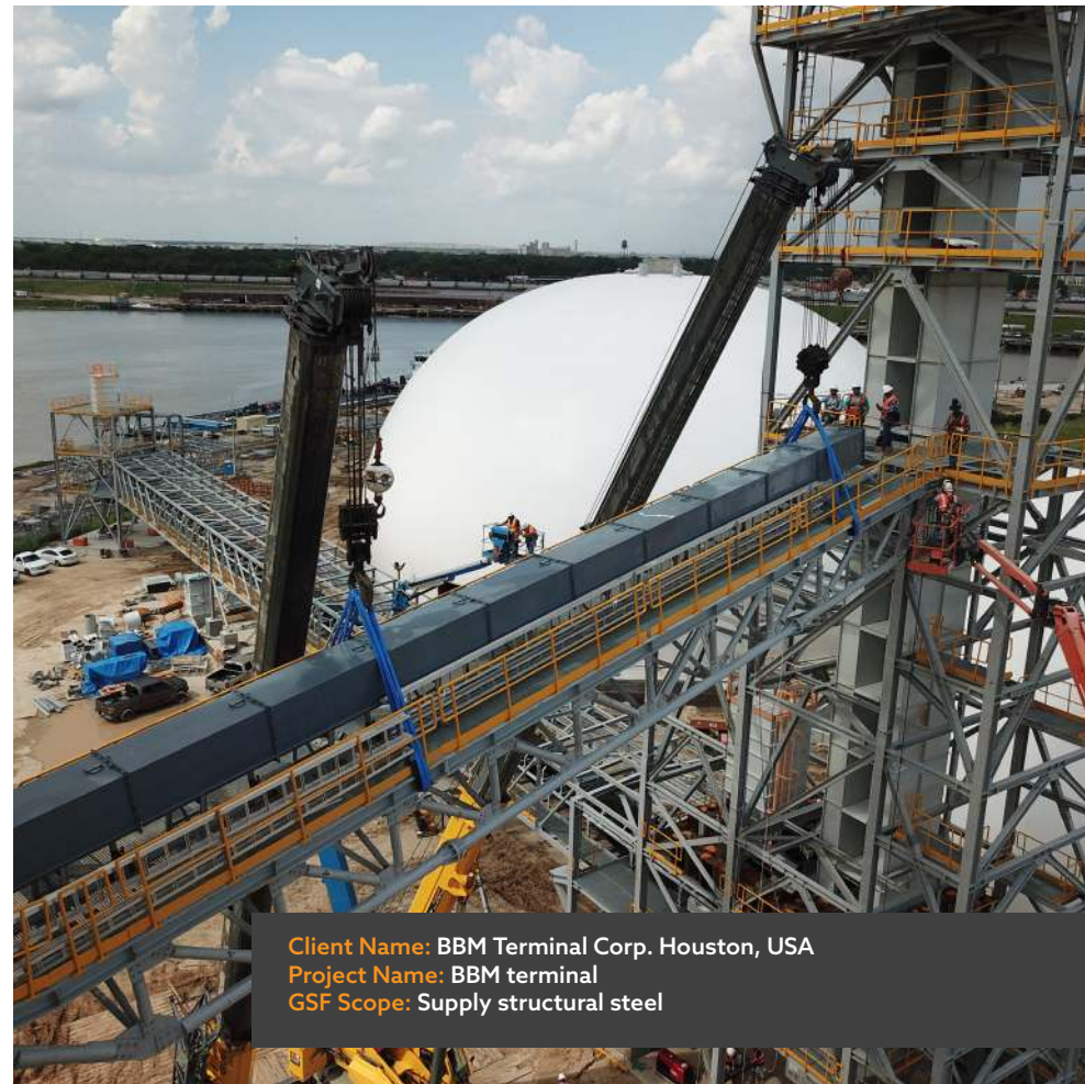
Client Name: BBM Terminal Corp. Houston, USA Project Name: BBM terminal GSF Scope: Supply structural steel