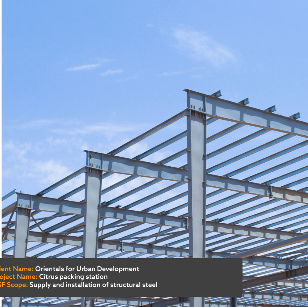
Client Name: Orientals for Urban Development Project Name: Citrus packing station GSF Scope: Supply and installation of structural steel